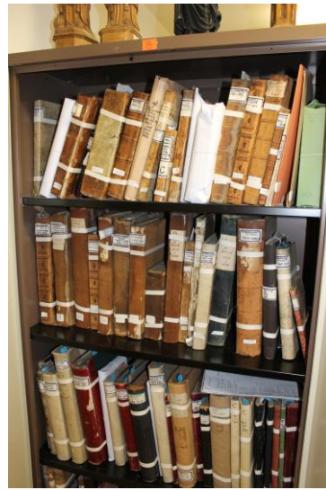
Accounts books tied and ready for packing