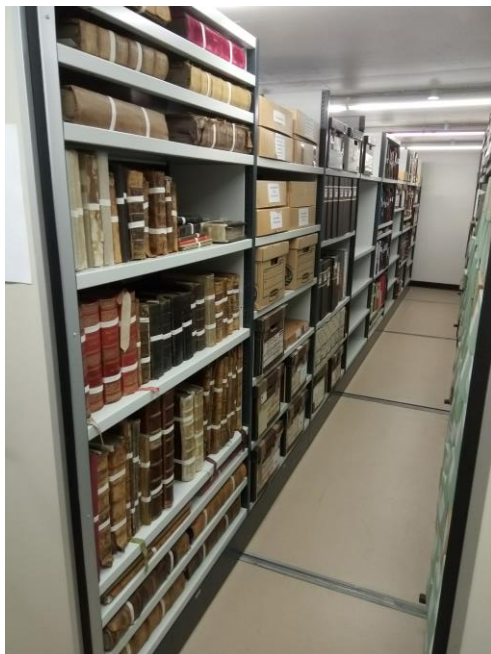
Our Archives unpacked in Durham