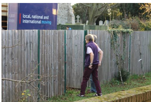
The lorry arrives