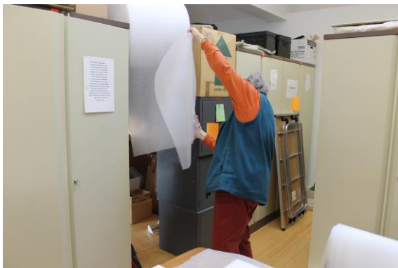
Cutting foam roll to wrap books