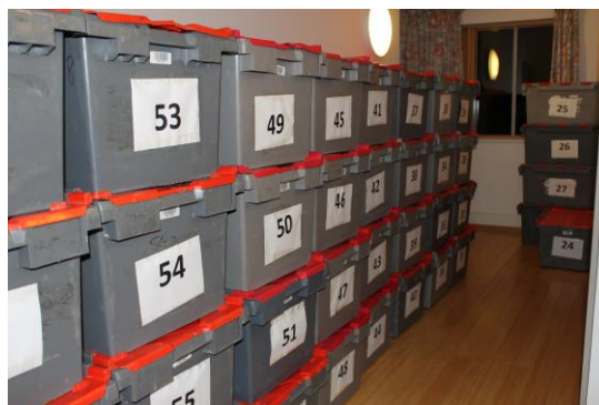
Crates stacked ready for removal