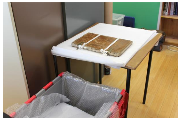
Book ready to be wrapped and packed in crate