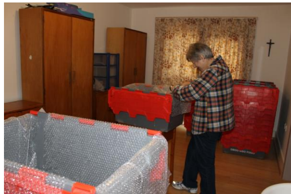
Lining every crate with bubble wrap