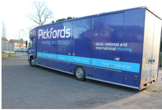
Setting off to Durham