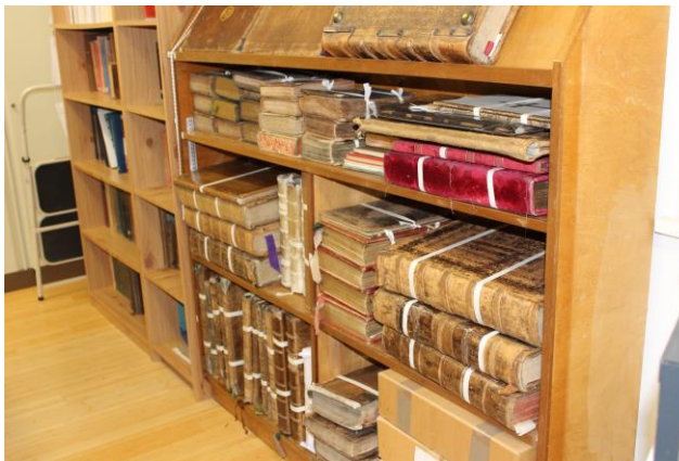
Music tied and ready for packing