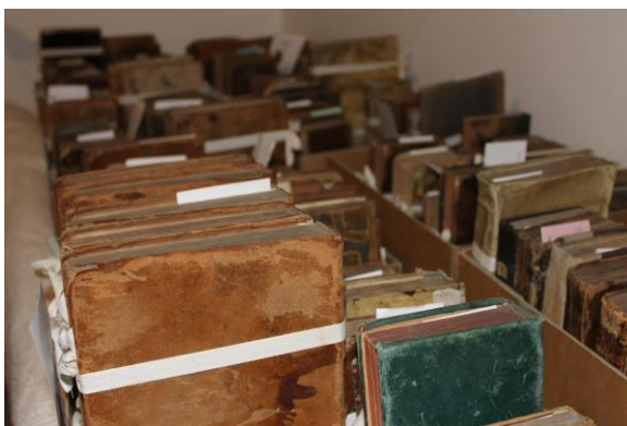
Books filed upright and in chronological order