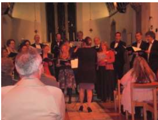
Concert at Stock Church

This year their efforts raised well in excess of £2,000. Thank you to everyone who has contributed in any way.