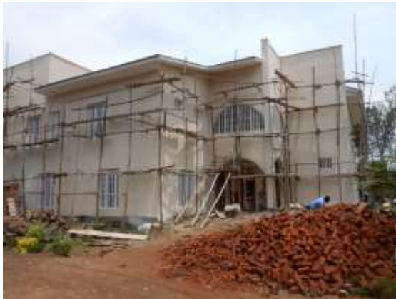
Great progress has been made! The Nutritional Centre also supplies accommodation for orphans