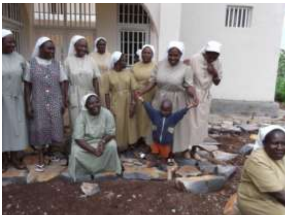
Outside the Nutritional Centre

The Sisters pass on their gratitude to all the fundraisers and to those who have prayed for them.