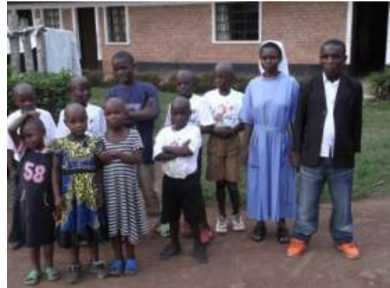
A group of the orphans who come every day to the Centre. The young man on the right has diabetes. We do not know how he will obtain his medication going in the future.

The Daughters of the Resurrection in Mirhi have sent us some photographs showing progress with the Nutritional Centre in Mirhi, DR Congo. You will remember we were raising funds to help them build the Centre which provides a facility to feed orphans and homeless families in the area.