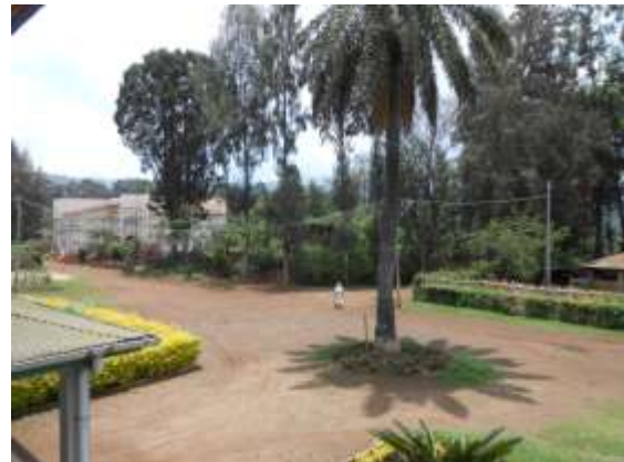
The entrance to Mirhi Convent with the Nutritional Centre in the background