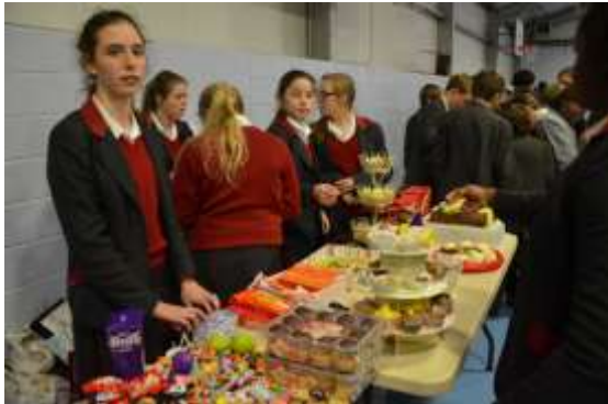
Senior School pupils at Fundraising event for Rwanda

School, Ecole Mère Hadewjch, at Murhesa near Bukavu (Prep School).